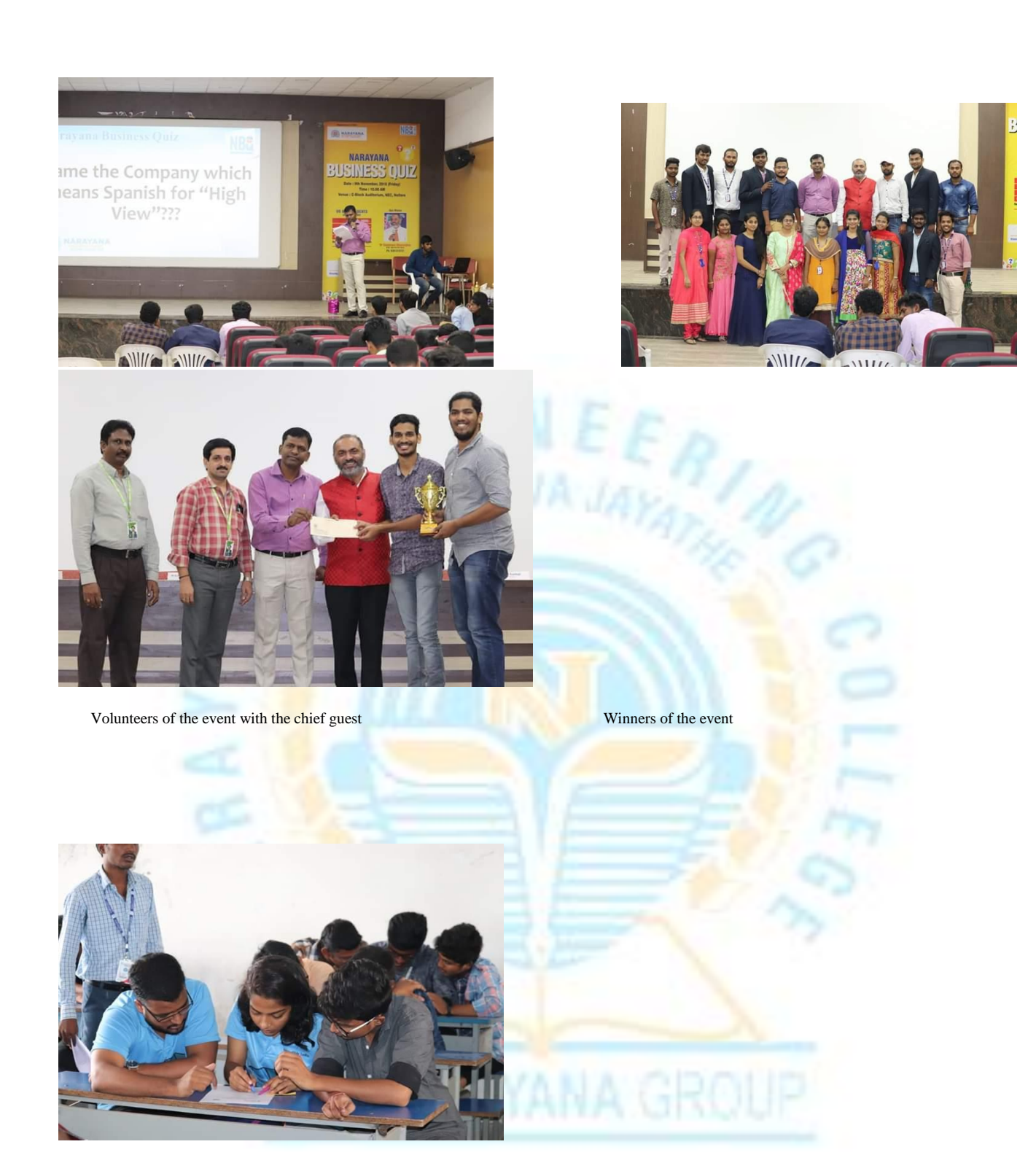
First round of the event